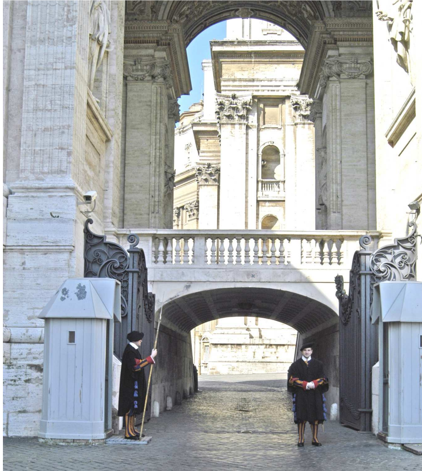
Fig.3 An entrance of Vatican City State controlled by Swiss Guards.

Once a vehicle approaches an entrance, the system, through the video surveillance system, acquires the licence plate and immediately check if it is enabled to enter. Anyway the vehicle is visually controlled by the Swiss Guards before and by the security personnel of the Gendarmerie after. If the vehicle is not enabled, an immediate signalling is sent to the control personnel.