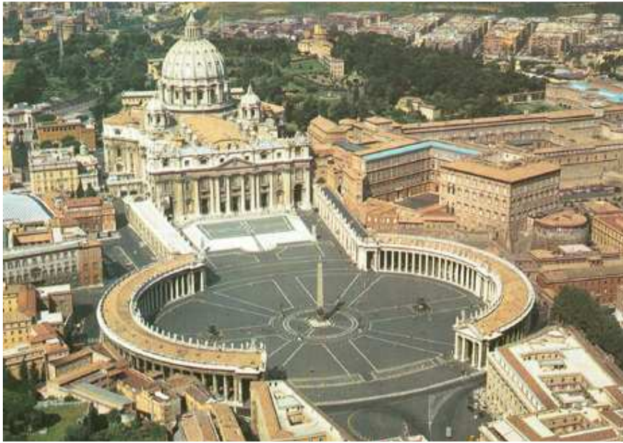
Figure 1: View of S. Peter Basilica and square, Bernini colonnade and part of Vatican City State.

The scope of the paper is to illustrate the mentioned advanced integrated security system, the difficulties found for its design and realization, and the results obtained, from its installation, in the normal and emergency situations. Due to secrecy reasons, the integrated security system is illustrated according to the general philosophy design, without illustrating specific details that could compromise the security of the system itself.